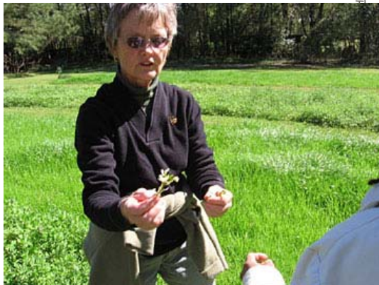
B offers a guest some edible arugula flowers in the garden.

Tools refurbished a pair of old cracker houses to use as a retail space. Items for sale inside include herbal teas, honey, organic gardening supplies, baskets, books and art processors are inspected annually by a certifying agency. -- Farmers and processors keep detailed records of their practices. -- Farmers maintain a written organic management plan.