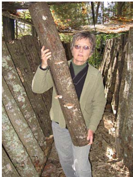
The shiitakes on your dinner plate begin here, in deciduous hardwood logs impregnated with the mushroom spores.

They were one of Florida's first organic farms and interest in their product spread throughout the neighboring counties and across the Georgia border to Valdosta.