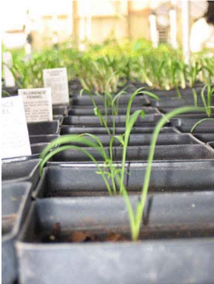
The farm grows more than 350 varieties of herbs - including the young fennel shown here - perennials and vegetables.

do things differently - and bigger - here.