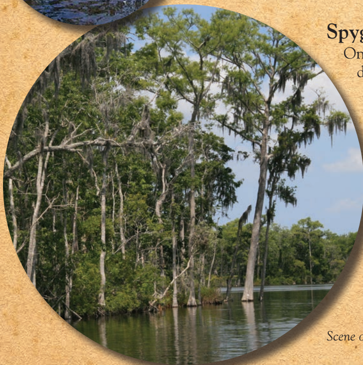
Scene on the banks of the lower Suwannee River.

One of the great rivers of the southeast, and unique among them in being neither dammed nor channelized, the Suwannee provides habitats for a great variety of plants and animals. The reach of the lower Suwannee passing through the refuge is affected by twice-daily tidal fluctuations. Its water is generally dark colored, but lighter than the tea-colored water of the upper Suwannee because it has mixed with the clear waters contributed by springs as it traveled southward. Magnificent as it seems, it is not a virgin forest that lines the shore. In fact it is relatively young. Extensively logged, first for cypress and then for hardwoods, these lands were changed not only by the removal of trees, but also by the building of roads, ditches, and rail lines needed to get to the logs and to get them out. That regeneration of the forest has come this far is a testimony to its resilience.