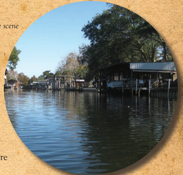
Town of Suwannee scene

Developed in the mid-twentieth century on land modified by dredging and filling, the Town of Suwannee is a complex of streets and canals. It is bordered by salt marsh on the west and swamp on the east. About a mile from the mouth of the river, it has direct access to both the river and the Gulf by means of separate channels. Water in the canals is strongly influenced by tides, and the plants and animals that occupy them are able to tolerate periodic flooding and wide fluctuations in salinity. Some native wildlife ventures into the town, but consisting of manmade land and water features, the town and its canals harbor a variety of exotic species and generalists that are not fussy about habitats. Among the plants is phragmites, or common reed. Generally thought to be an undesirable plant, opinions differ as to whether it is a native or an invader. Water hyacinth is a common exotic. Likewise common among the birds are double-crested cormorants. Definitely natives, they are generally despised because they are ungainly and prodigious consumers of fish.