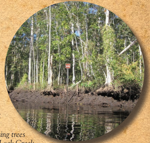
Bank erosion undercutting trees along Lock Creek

Possibly the best known of Suwannee paddling trails, this takes one through small creeks that wend through swamps and marshes. Light filtered through the leaves of tupelos, ashes, and swamp bay, and reflected off still waters casts an enchanted glow on a surprising variety of wildflowers. Fishes and alligators are abundant here, but this is the true haunt of wood ducks, river otters and turtles. Paddlers encounter much evidence of the effects of twice-daily tides. Erosion of soil from the banks undercuts large trees, and areas of mud are deposited elsewhere, depending on currents and eddies. The creek and the land are thus in the constant process of formation and reformation. Unfortunately, erosion of the banks makes for frequent treefalls that may block channels and impede the progress of paddlers.